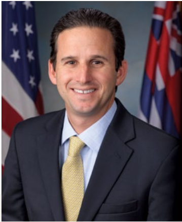
Senator Brian Schatz (D-HI)