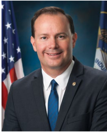
Senator Mike Lee (R-UT)