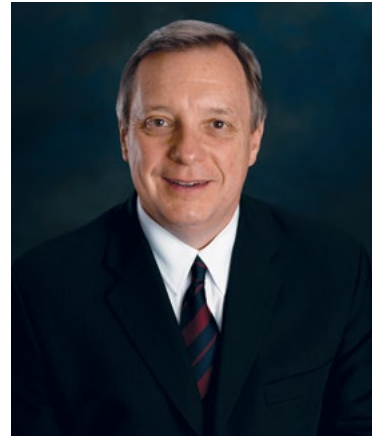
Senator Richard Durbin (D-IL)